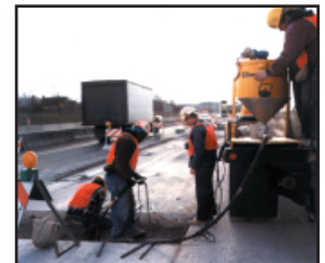
Highway Dowel Rods