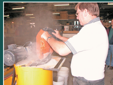
Twenty-two gallon mix tank allows for a batch size of up to 3-50 lb. bags.

Visit our web site: www.chemgrout.com • E-mail: info@chemgrout.com