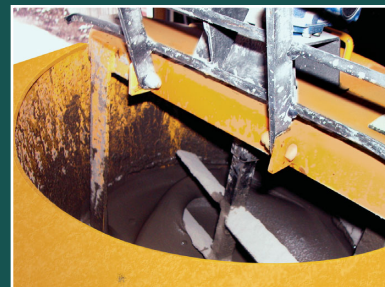
Three tough steel mixing blades thoroughly blend material providing a uniform mix.