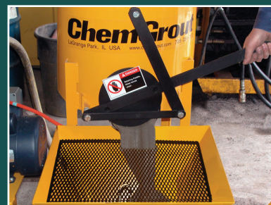
Mix tank's large slide gate allows for an easy transfer of material.