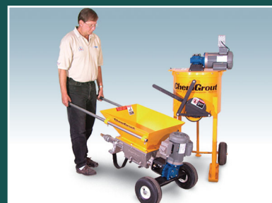
Two-piece construction makes for easy mobility through standard size doorways.